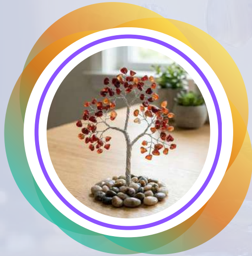
CARNELIAN (RED/BLOOD- COLORED)